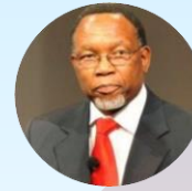
H.E Kgalema Motlanthe Former President of South Africa