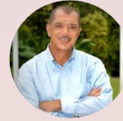
H.E James Michel Former President of Seychelles