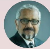
H.E Cassam Uteem Former President of Mauritius