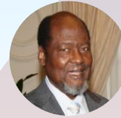
H.E Joaquim Chissano Former President of Mozambique