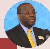
Hon. Willy Mutunga Former President, Supreme Court of Kenya